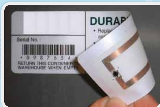
At left, a Radio Frequency Identification (RFID) tag could help NASA mission inventories.