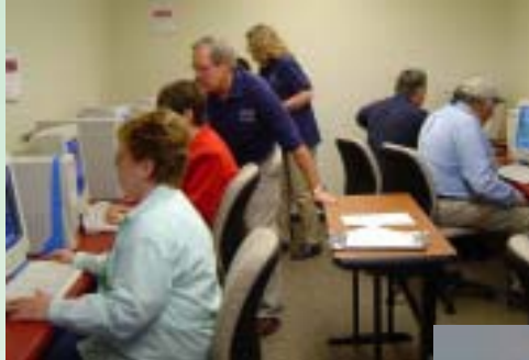
Little Priest Tribal College Geospatial Boot Camp 2004

Women in Science Programs – The second annual Women in Information Technology and Engineering program held April 16-17, 2004, offered interactive hands-on technological activities to high school students and faculty. The program, co-sponsored by EPSCoR, the Peter Kiewit Institute (PKI), and Union Pacific was a great success both this year and last. It gave high school girls a sense of excitement and engagement in technology-related fields while providing a continuing network for communication among students, teachers, and PKI personnel. Schools from throughout the state were represented by 24 students and 24 teachers. Additional summer camps in Information Technology focused on Women in IT as well as Diversity in IT and IT for Hearing Impaired.