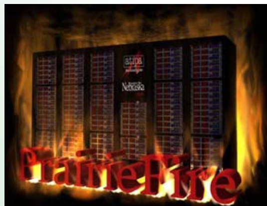
Prairie Fire Supercomputer

neering Research Facility in downtown Lincoln. The Access Grid is a group-to-group interaction system to bring groups together simultaneously for large-scale scientific and technical collaborations, lectures,