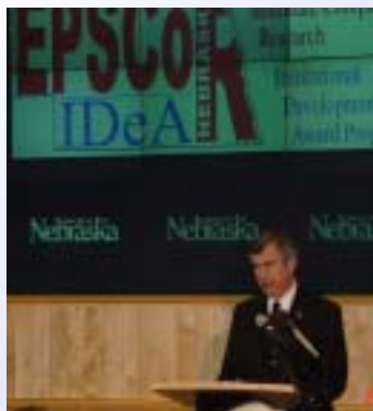
Governor Johanns congratulates EPSCoR on NSF grant