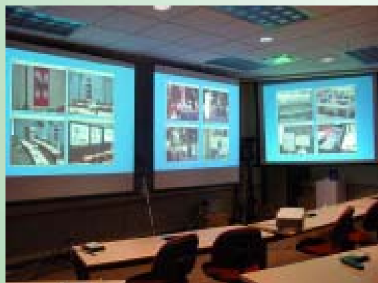
Access Grid Node at UNL Kauffman Center

node (resulting from a current NSF Major Research Instrumentation (MRI) project) has been implemented at the Computer Science and Engi-