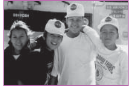
5th grade students at Aeronautics Day

Through the Native American Outreach program the Aviation Institute and NASA Nebraska EPSCoR held Aeronautics Day at the Sioux City Gateway Airport in Iowa on October 11, which allowed 150 Native American fifth grade students from surrounding schools the opportunity to experience hands-on aviation through presentations and guided tour of the Iowa Air Guard and JetSun Aviation.