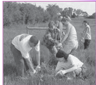
UNO Aviation Institute field workers