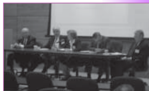
Panel discussion group