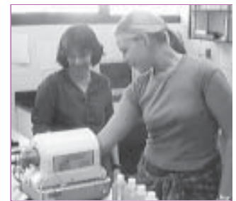
Women in Science conference participants

Four undergraduate students from three institutions (Alcorn State U., Grambling U., and New Mexico Highlands U.) participated in lab research at UNL in the summer of 2000 as part of a program to increase minority students pursuing advanced degrees in science and engineering.